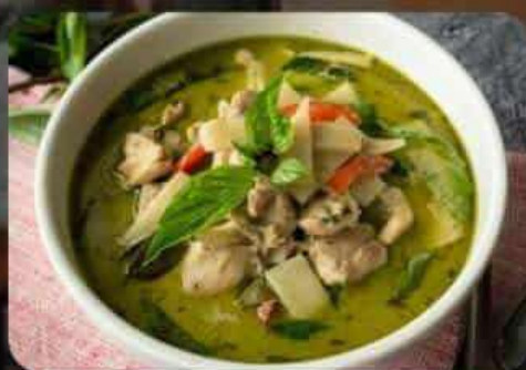
Green Curry with Chicken