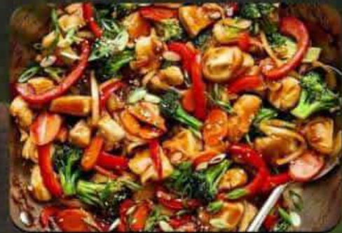
Chicken Stir Fried