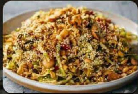
Tea Leaf Salad