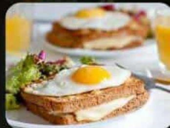
Fried Egg + Salad