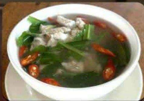
Spicy Sour Soup Chicken