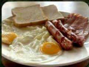
American Breakfast set