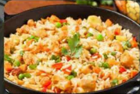
Chicken Fried Rice