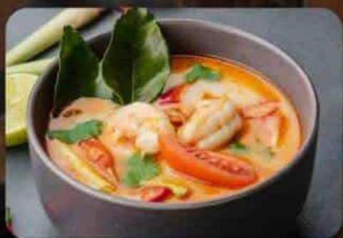
Spicy Sour Soup Seafood