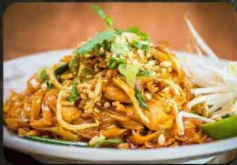
Chicken Pad Thai