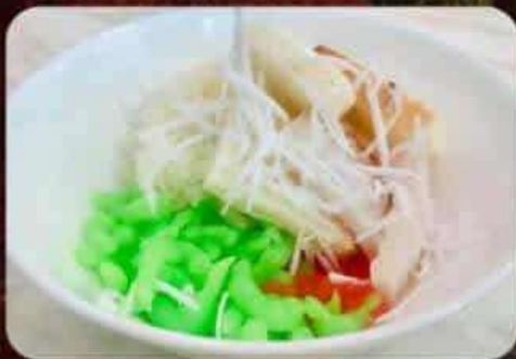
Shwe Yin Aye