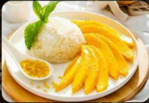
Mango Sticky Rice