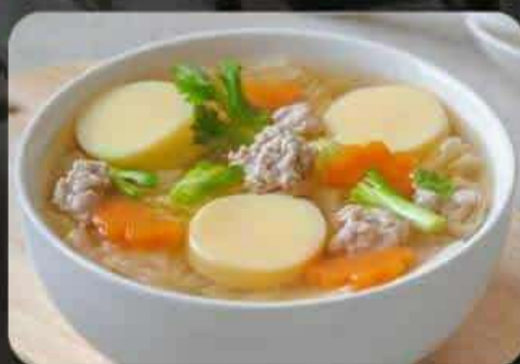
Clear Soup with Egg Tofu and Minced Pork