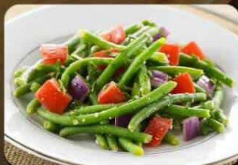
Long Bean Salad