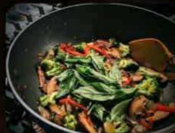
Stir-Fried Vegetation Basil