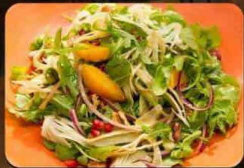
Mixed Vegetable Salad